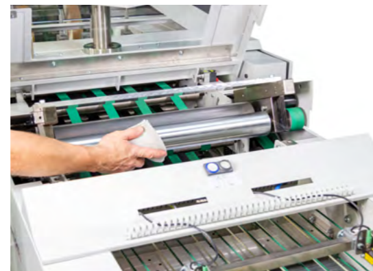
Easily accessible pressing unit of the delta-pro