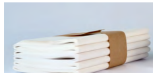
Example for product stacks from the delta-pro